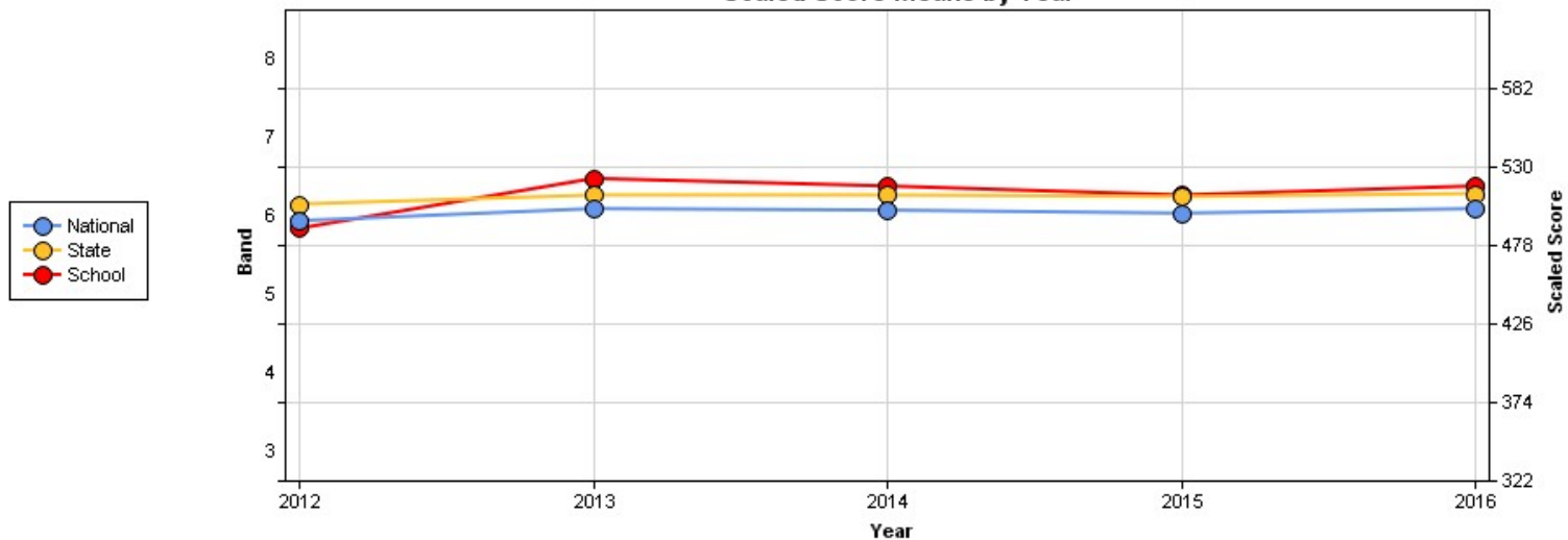
Scaled Score Means by Year

Caution should be used when drawing conclusions from this data, particularly with small groups of students