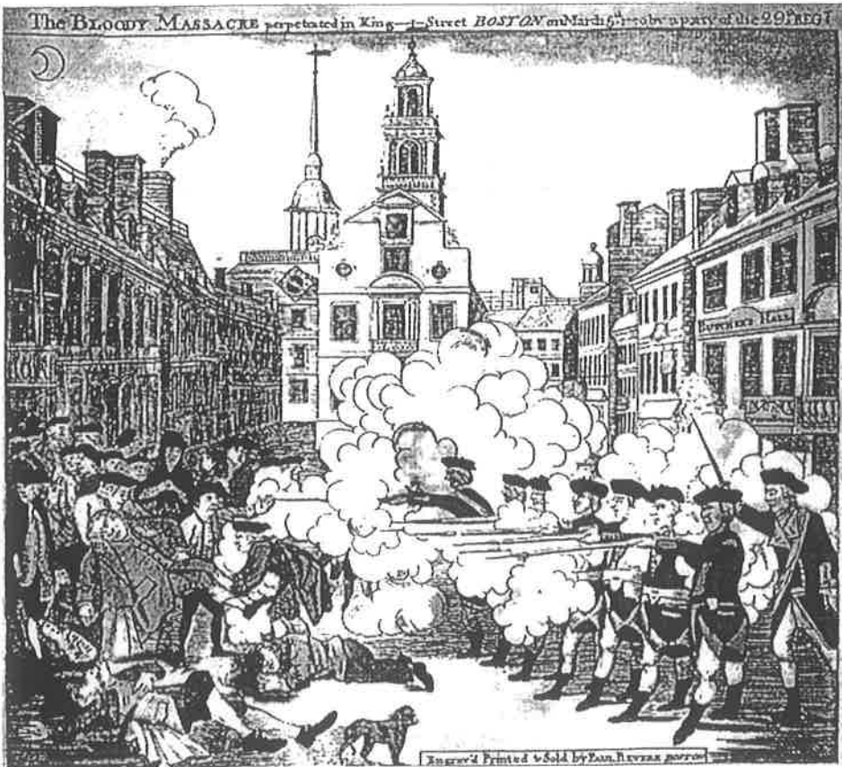
"Engraving Printed and Sold by Paul Revere," March 28 1770.

This picture shows an important event in the American Revolution. Using your knowledge as an historian, answer the following questions: